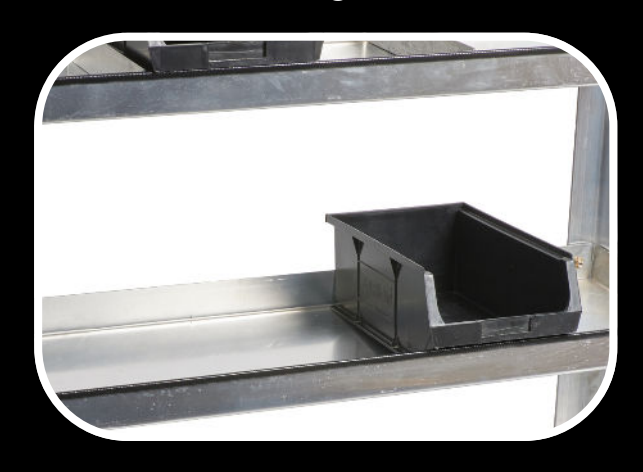
Shelf Dividers G621 | Made to fit any shelf.